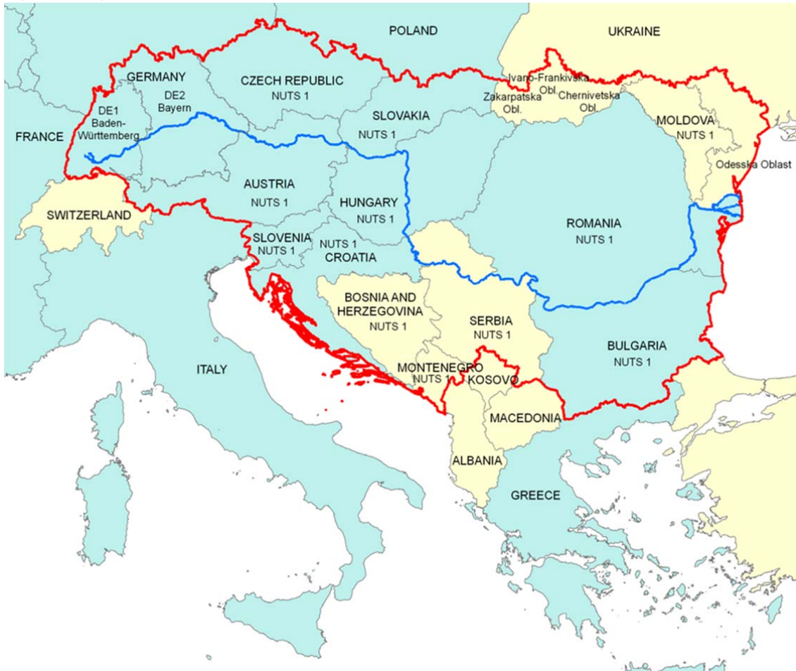
Figure1. Programme area

Geographically, the DTP area overlaps with the territory addressed by the EU Strategy for the Danube Region (EUSDR), comprising also the Danube river basin and the mountainous areas (such as the Carpathians, the Balkans and part of the Alps). It is the most international river basin in the world. The area makes up one fifth of the EU's territory and it is inhabited by approximately 114 million people. The variety of natural environment, the socio-economic differences and cultural diversity of the various parts of the area may be perceived as major challenges, but actually represent important opportunities and unexploited potential.